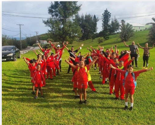
Francis Patton Primary School celebrating their first "Walk to School" event to raise awareness of fossil fuel pollution for the Climate Change Pathway.