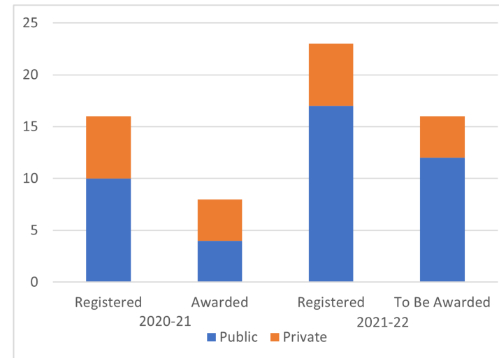
Figure 1: Eco-Schools schools 2020-2022