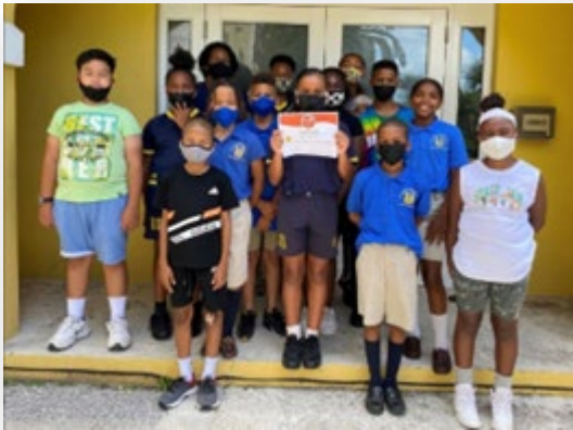
Victor Scott Primary School with their Eco-Schools Recognition Certificate, awarded for their work on the Energy Pathway during the 2020-2021 academic year.