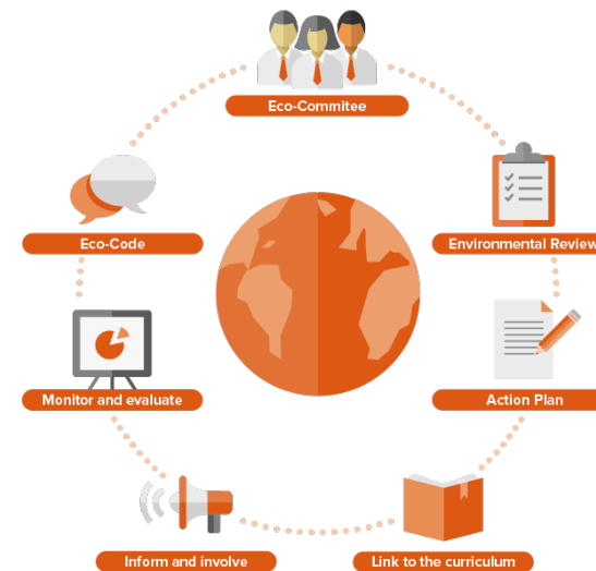
Figure 2: The Eco-Schools 7-Step Framework, moving clockwise from "Eco-Committee".